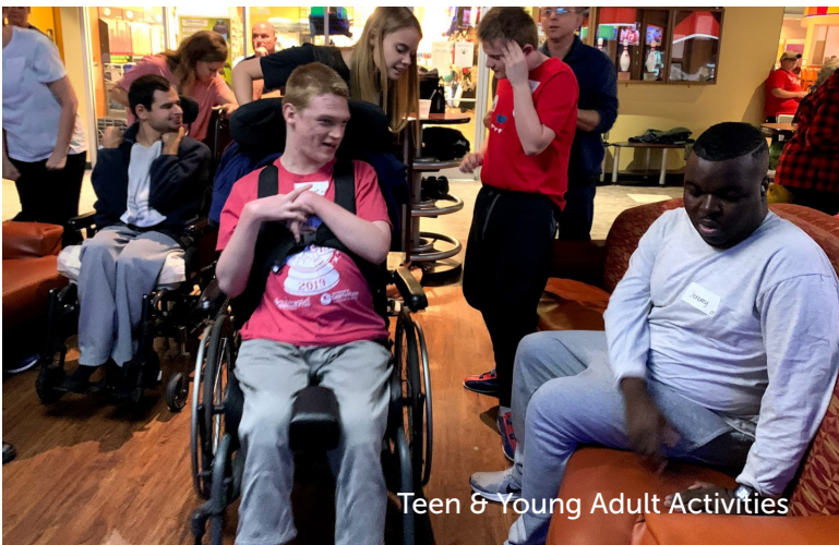
Teen & Young Adult Activities