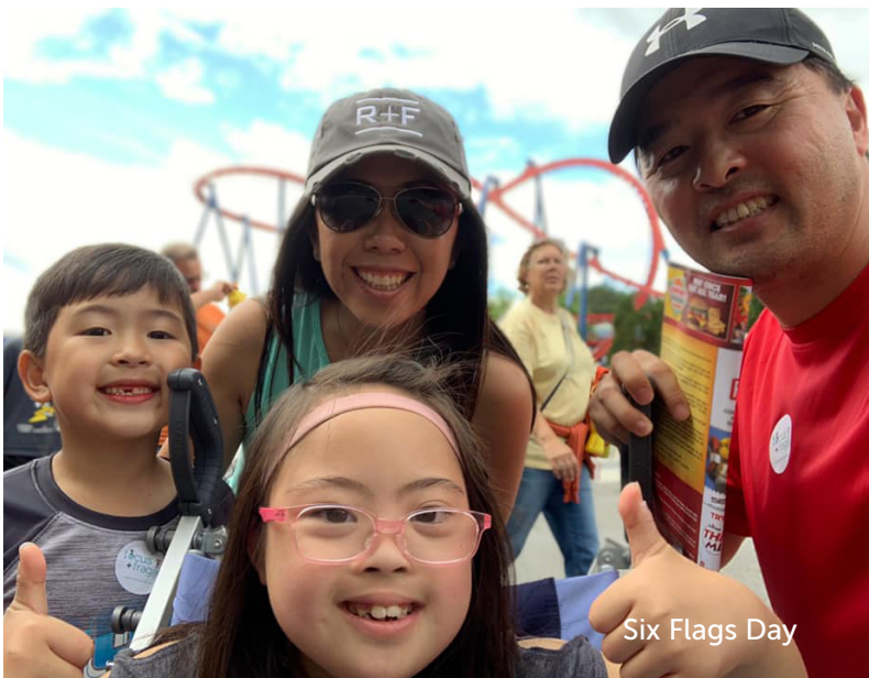
Six Flags Day