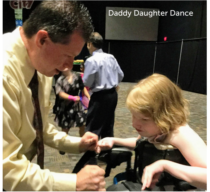
Daddy Daughter Dance