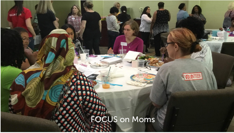
FOCUS on Moms