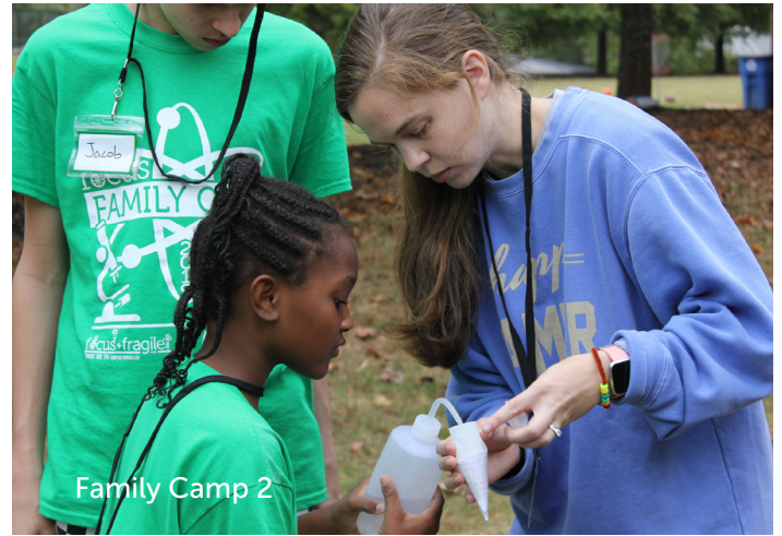
Family Camp 2