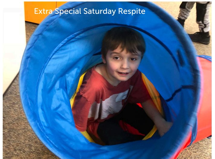
Extra Special Saturday Respite