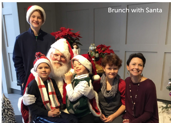
Brunch with Santa