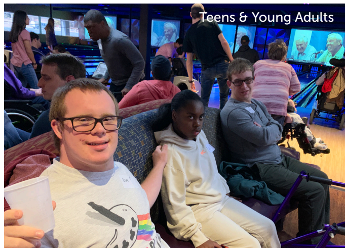
Teens & Young Adults